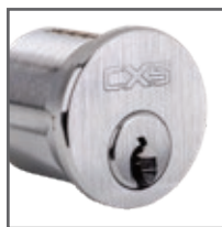
RIM & MORTISE CYLINDERS