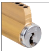
KIK / KIL CYLINDERS